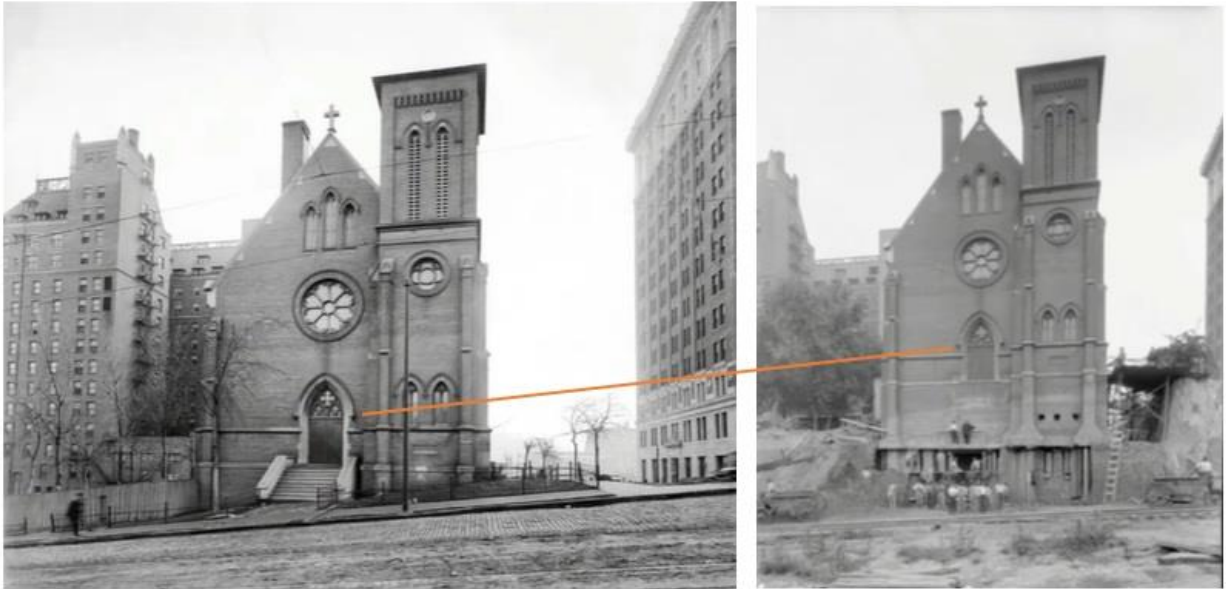
Mud Flood Hills Must Go

These mud slides buried the buildings constructed in the late 1700s. So please do as much research as you can on mud flood evidence, because this is a part of our history that is missing in the timeline. These missing events messes up the cycles we have in nature.