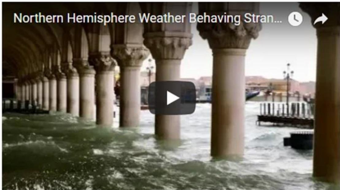
Northern Hemisphere Weather Behaving Strangely (742)

So as you can see, there are so many anomalies in the atmosphere happening in Europe. Apart from the massive snows, they also had coastal flooding, with the weather behaving strangely, and extreme cold in the UK during late summer, which I've done a lot of video about.