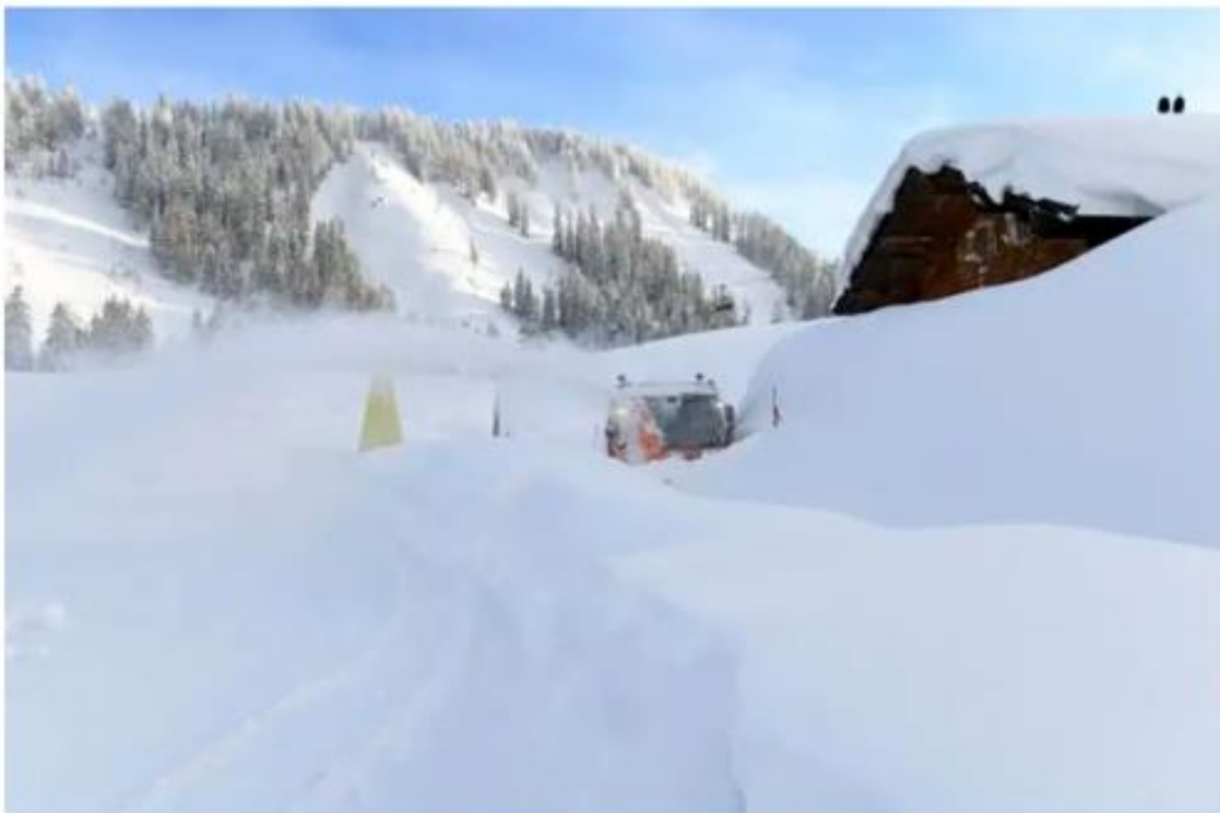
A snow blower works on a road at the Loferer Alp, Austrian province of Salzburg

More importantly, when I said “deep snows”, it looked like this. This is the picture of how much snow that came down. It was a staggering amount, yet the mainstream media just said that Austria had a “little” extra snow during the weeks long event.