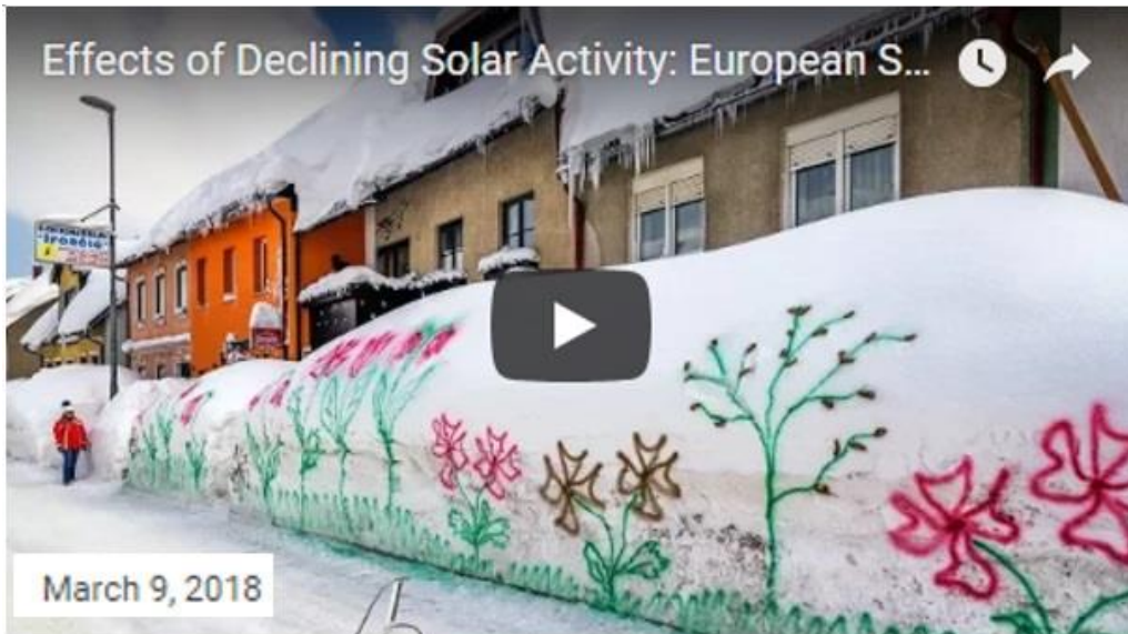
Effects of Declining Solar Activity: European Superfreeze and Dust Storms (545)

Europe had loss of crops which caused vegetable shortages continent wide, this again, was all back 2017 & 2018 and it does look like a trend to me.