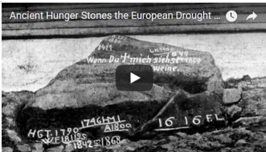
Ancient Hunger Stones the European Drought Cycle Clock (698)

In the Czech Republic, formerly known as the Czech Lands, they have a mega drought that revealed the Ancient Hunger Stones.