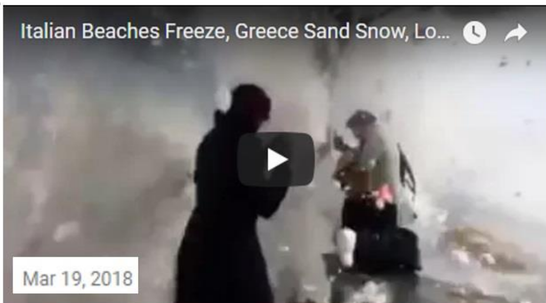
Italian Beaches Freeze, Greece Sand Snow, London Snow, Morocco Next (555)

They put a video from 2017 as well, which I'm very grateful for, because now we can see the trend. When we look back at 2018's spring, Italian beaches were also frozen and so were the beaches in Greece. What's in store for 2019?