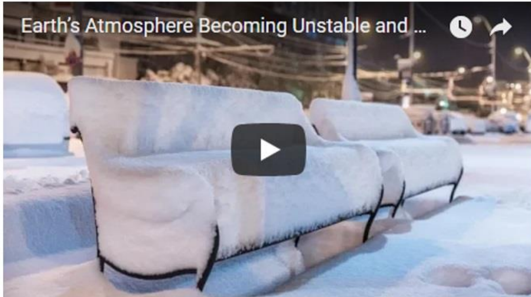
Earth's Atmosphere Becoming Unstable and Why Ancient Cultures Tracked the Cycles (754)

Snows were down to the beaches Morocco too.