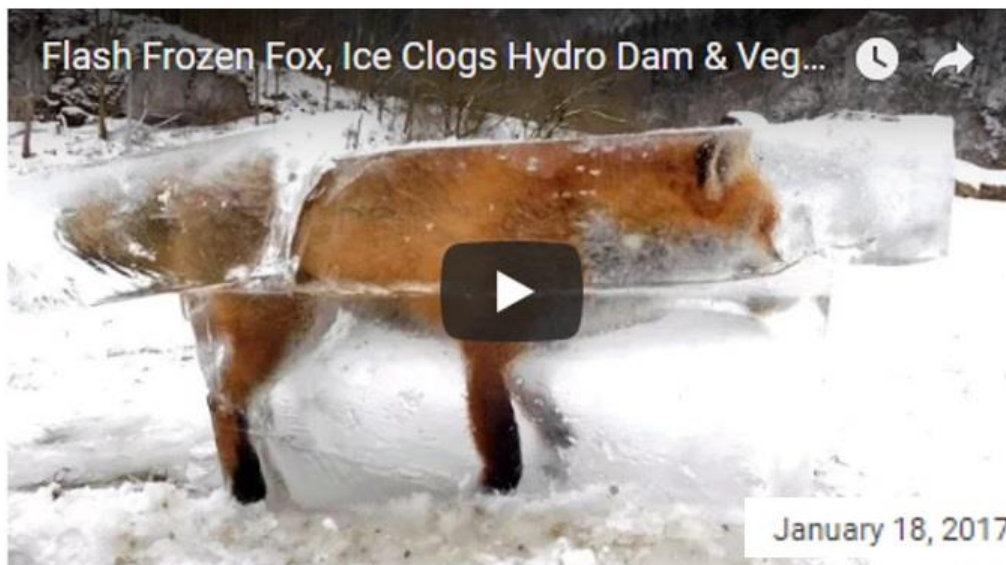
Flash Frozen Fox, Ice Clogs Hydro Dam & Vegetable Shortages Across Europe (293)

Europe had loss of crops which caused vegetable shortages continent wide, this again, was all back 2017 & 2018 and it does look like a trend to me.