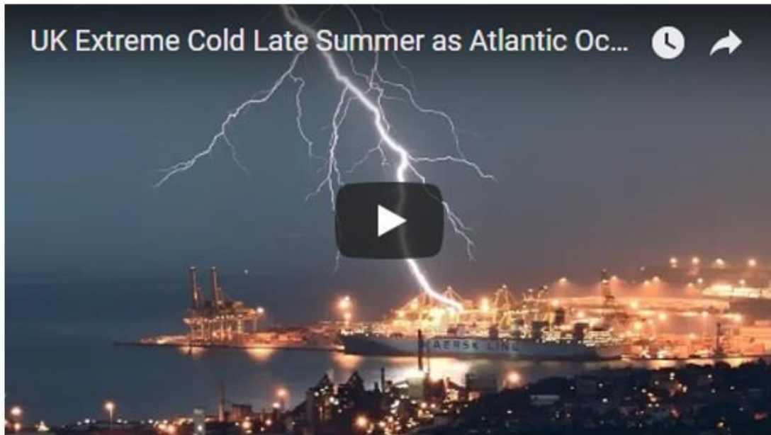
UK Extreme Cold Late Summer as Atlantic Ocean Temperatures Change (704)

In the Czech Republic, formerly known as the Czech Lands, they have a mega drought that revealed the Ancient Hunger Stones.