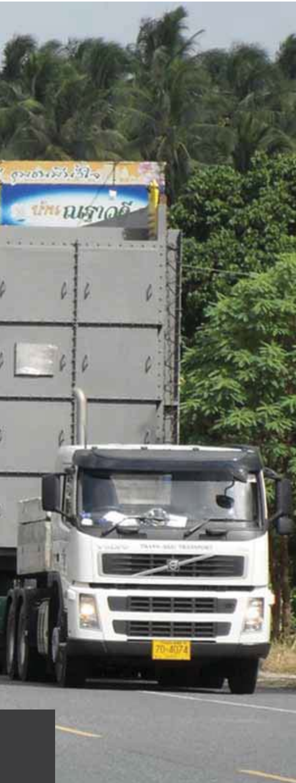
The Freight Company hauls a heavy load in Thailand